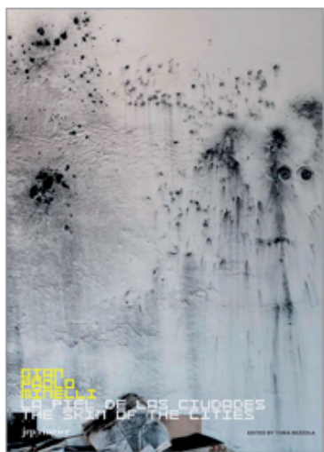
Gian Paolo Minelli The Skin of the Cities La piel de las ciudades